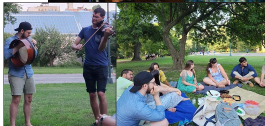
Behind the Met with music and a picnic in July