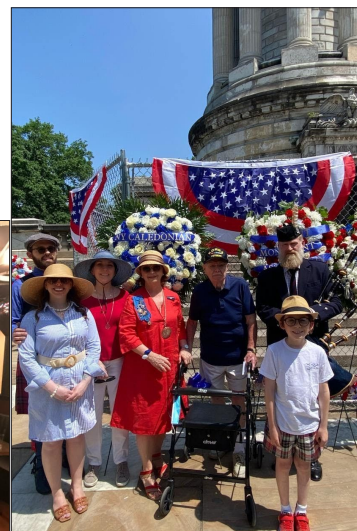
Memorial Day at the Soldiers' and Sailors' Monument